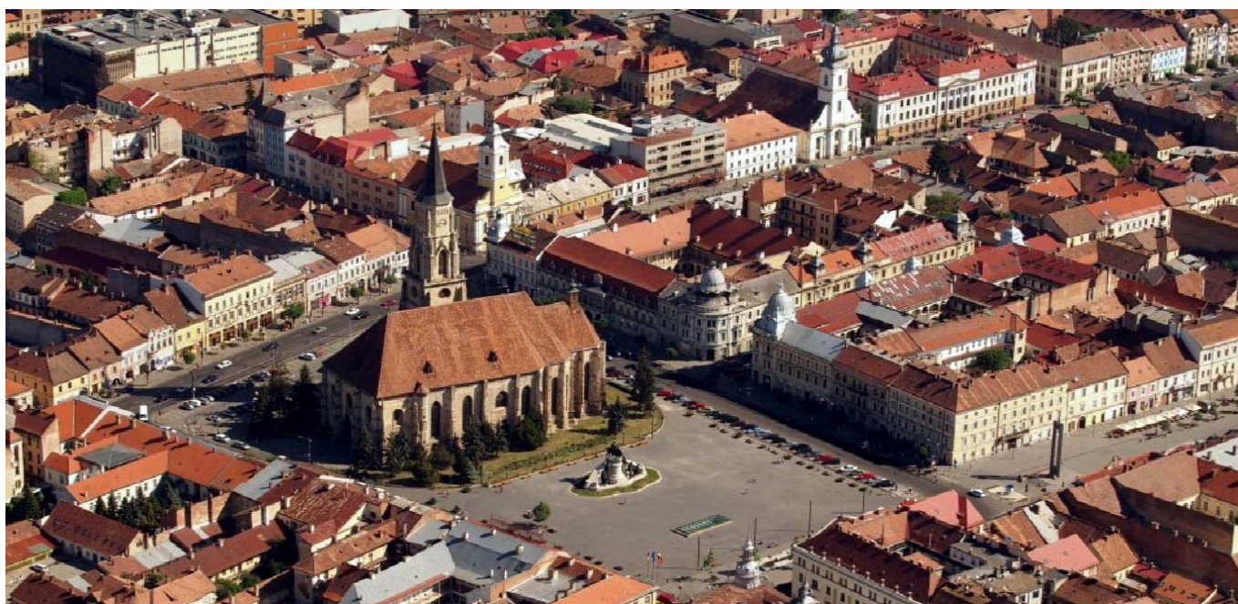
Piața Unirii / The Union Square